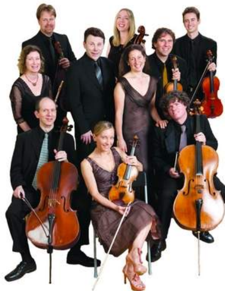
Worcester Chamber Music Society.

For season nine, WCMS will present 16 concerts (its initial season consisted of four) of chamber gems as well as rarely performed works in a number of different settings in Worcester and Worcester County. The "Main Stage Series" includes, besides "Wunderkind!," "Water Games," "Mozart Fest" and "Bach and Beyond." The popular annual free family concert will be back (this time "The Emperor's New Clothes" March 1 in Mechanics Hall), and two special presentations will be in conjunction with Old Sturbridge Village and Clark University. "Café Concerts" (two at Nuovo Restaurant and one at Eric's La Patisserie, both in Worcester) and "Very Open Rehearsals" are also returning,